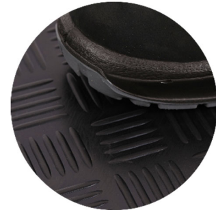
G1306 Diamond Pattern Mat Black