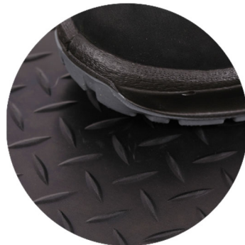
G1318 Pyramidal Pattern Mat black