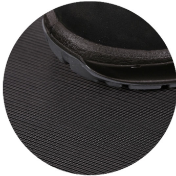
G1301 Fine Ribbed Mat grey